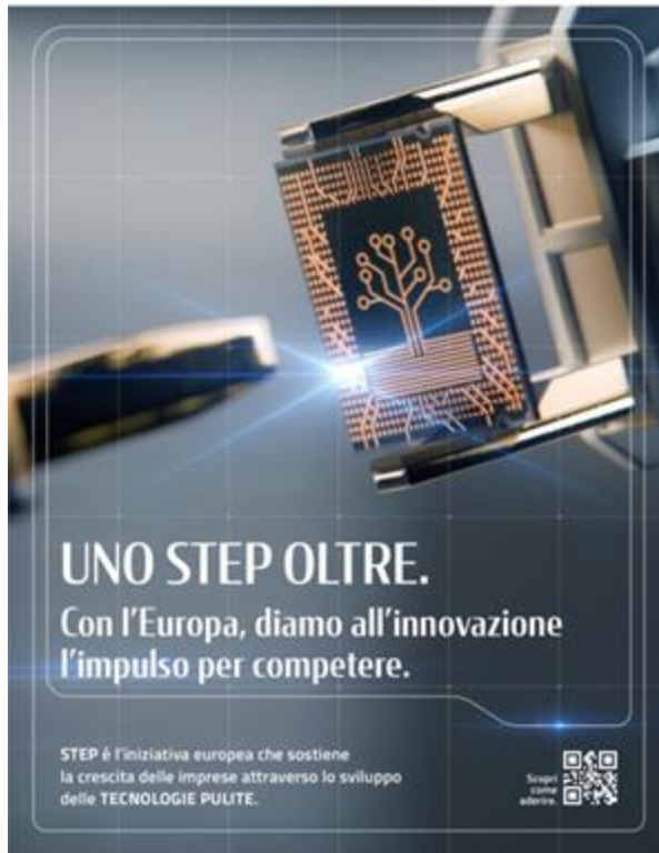
CLEAN AND EFFICIENT TECHNOLOGIES