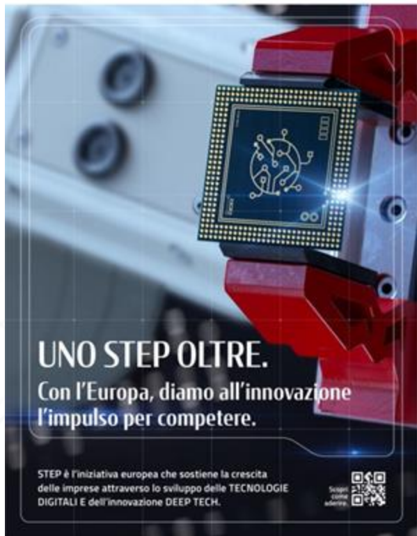
DIGITAL AND DEEP TECH